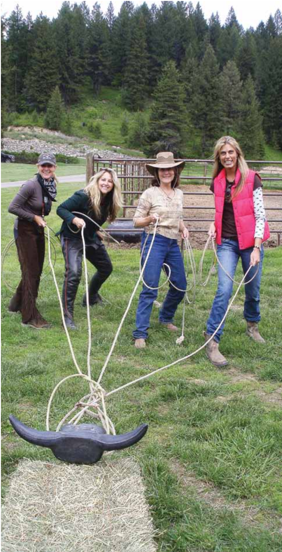
Lassoing the steer came naturally to these ladies.